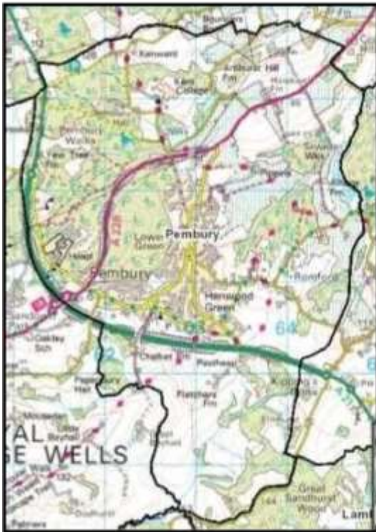
The Pembury Parish Boundary: